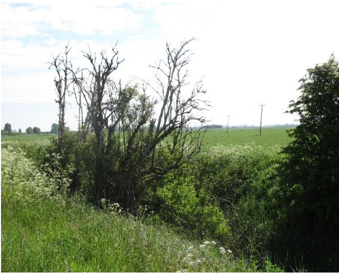
Elder bushes, reach 5-15

A recent joint inspection of the Northern Area has been undertaken with the Chairman and District Officer. The inspection indicated that the majority of district drains are in a satisfactory condition and being maintained to a good standard.