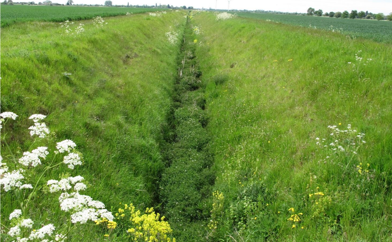
Rifle Butts, reach 59-60

A recent joint inspection has been undertaken with the Southern Area District Officer. The inspection revealed the District Drains in the southern area, are generally in a satisfactory condition and being maintained to a good standard. However, the inspection highlighted that sporadic stands of reed and emergent aquatic vegetation are evident throughout the Rifle Butt drains, reaches 54-55-56-57-58-59-60-61-62-63-64. It is recommended that the affected drains are treated with an application of Roundup to control the emergent aquatic growth later in the year.